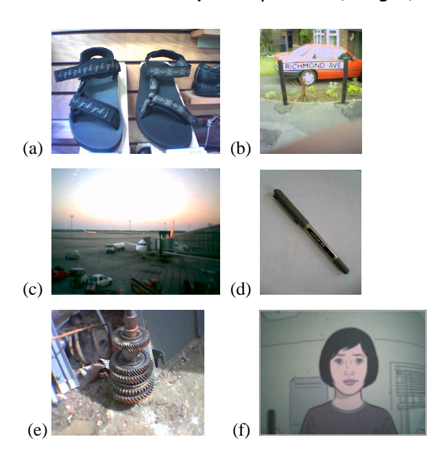
Figure 2. Images used to complete a task with someone who was absent at the time of capture.

The importance of timely delivery is reflected in the fact that about half of these images were sent at the time of capture. Figure 2(a) shows a choice of sandals which a woman found for her husband while shopping. She sent the image to his phone and immediately called him to discuss the selection. This mode of communication saved an extra shopping trip. Moreover, by sending the image, the woman dynamically added to the common ground she shared with her husband and thus simplified the conversation.