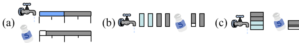
Figure 2. Consumption-Level Icons: (a) Horizontal Icon, (b) Vertical Icon, and (c) Fill-Up Icon.

food similar to how they were taught by their nutritionist, but did not fully understand the categorization.