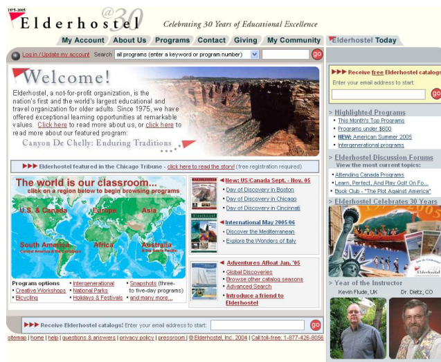
Figure 2. Screenshot of www.elderhostel.org/welcome/home.asp

67% of the original guidelines consistently being answered by participants in exactly the same way. A comparison of the responses of the 9 new merged guidelines on the new set of guidelines with the separate 23 unmerged equivalent guidelines on the original set found that 7 out of the 9 merged guidelines were answered unanimously by participants compared to only 12 out of 23 equivalent unmerged guidelines being answered in exactly the same way.