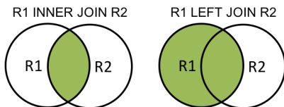
Table List : (T1 [alias] <join type> T2 [alias] [ON <condition list>]) <join type> T3 [alias] ...

Condition List : Clauses ( ) separated by AND/OR